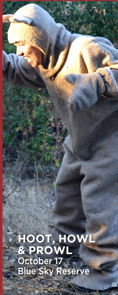
HOOT, HOWL & PROWL October 17 Blue Sky Reserve