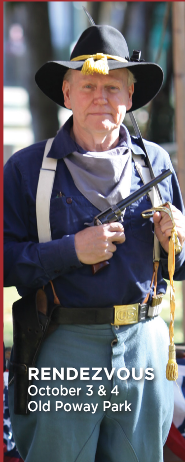
RENDEZVOUS October 3 & 4 Old Poway Park