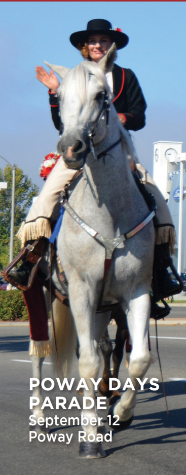
POWAY DAYS PARADE September 12 Poway Road