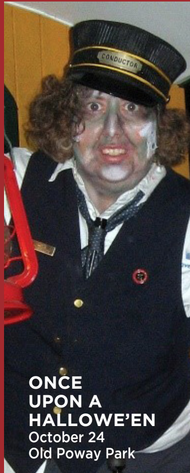
ONCE UPON A HALLOWE'EN October 24 Old Poway Park