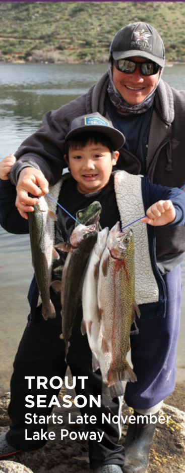
TROUT SEASON Starts Late November Lake Poway