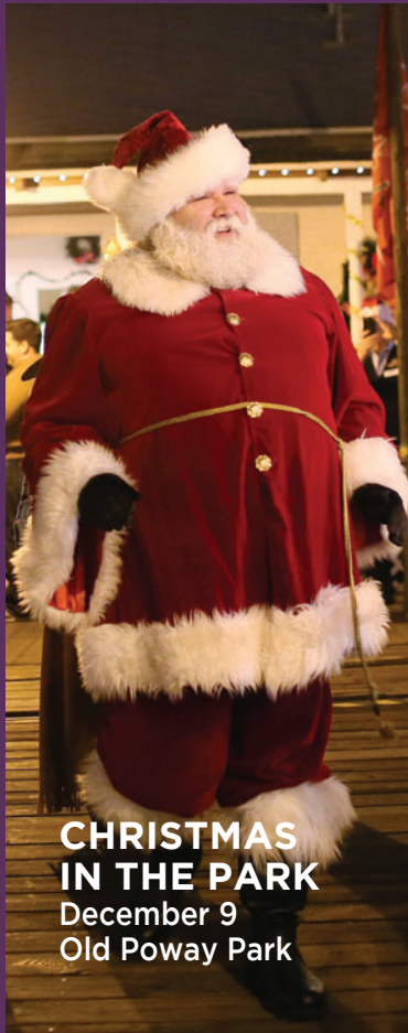
CHRISTMAS IN THE PARK December 9 Old Poway Park