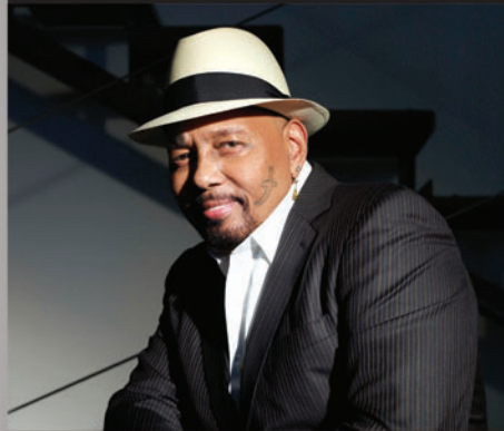
Aaron Neville DEC 2 • 8PM