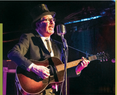
Sounds of The Big Easy FEB 24 • 8PM