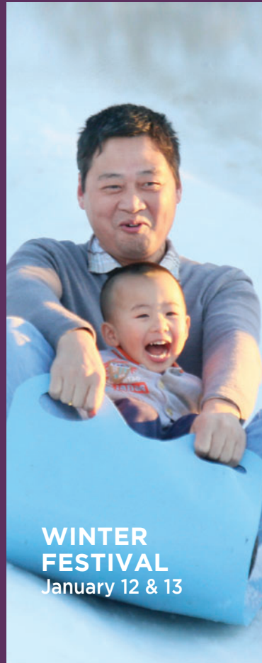
WINTER FESTIVAL January 12 & 13