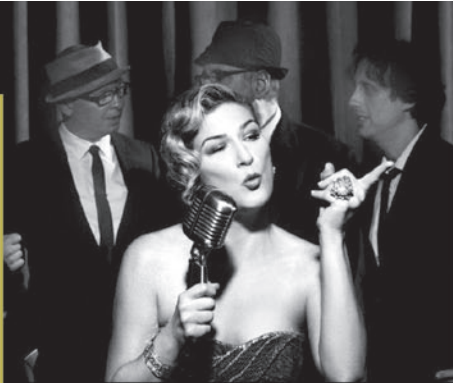
Ana Gasteyer NOV 4 • 8PM