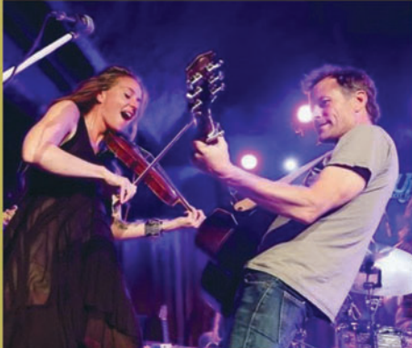
Love Letters from Vietnam NOV 18 • 8PM