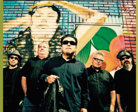
Los Lobos: Disconnected, An Acoustic Show MAR 16 • 8PM

Tickets Available at www.PowayOnStage.org At the Poway Center for the Performing Arts (Convenient, free parking) 15498 Espola Road | Poway, CA 92064 | 858.748.0505