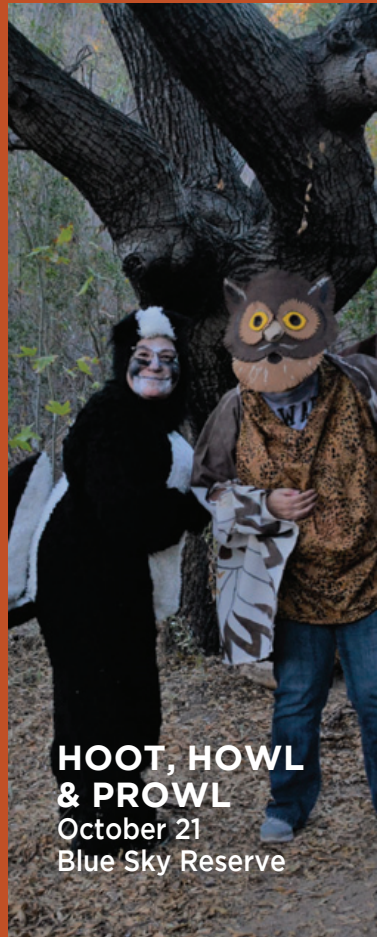
HOOT, HOWL & PROWL October 21 Blue Sky Reserve