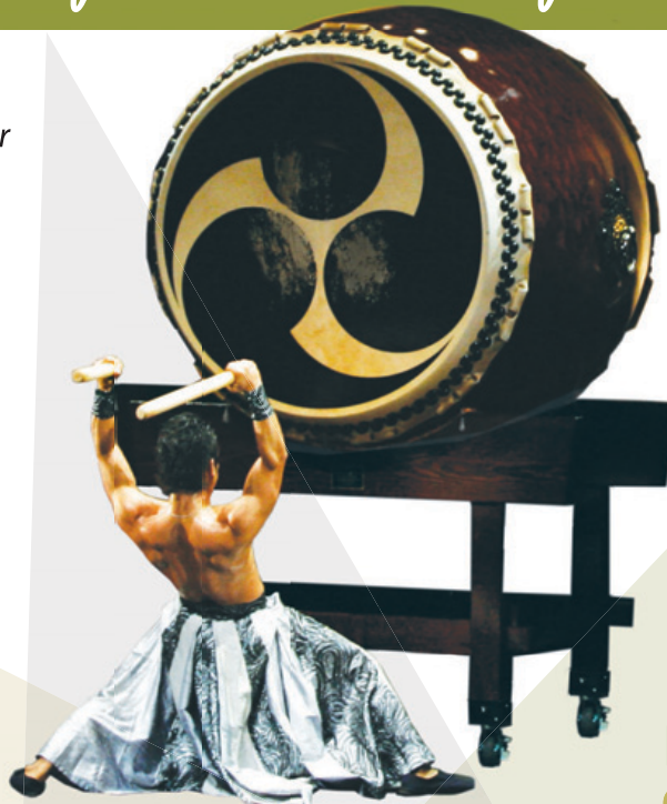
TAO: Drum Heart