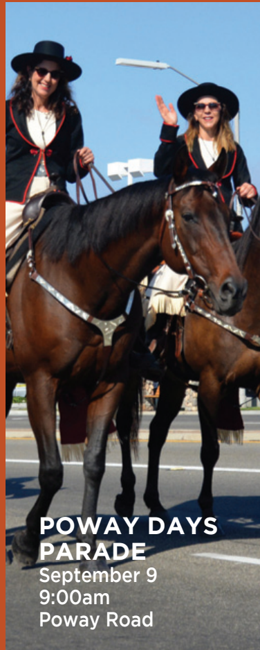
POWAY DAYS PARADE September 9 9:00am Poway Road