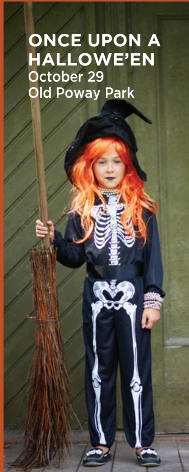
ONCE UPON A HALLOWE'EN October 29 Old Poway Park