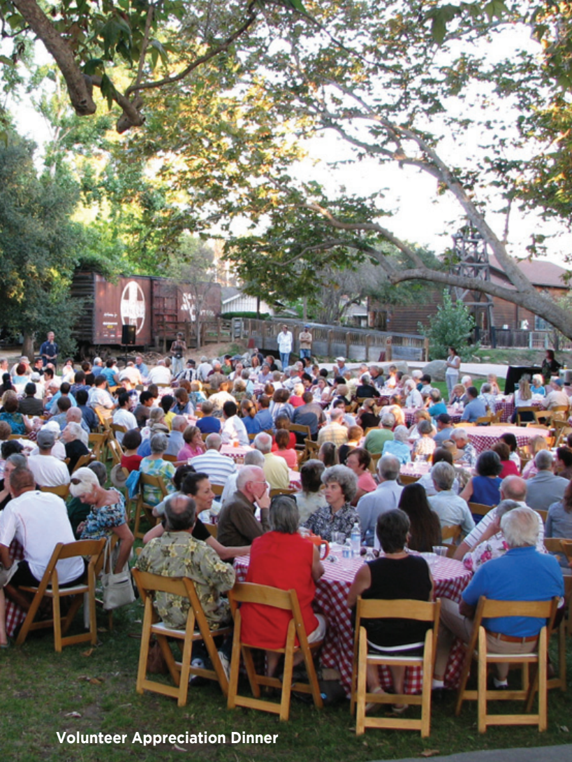
Volunteer Appreciation Dinner