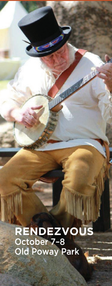
RENDEZVOUS October 7-8 Old Poway Park